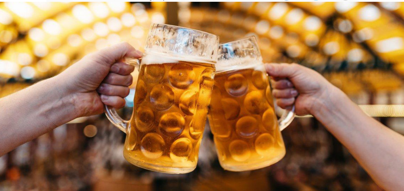
New York has an endless number of festivals and parties where drinking at noon is acceptable and lederhosen are encouraged.

NEW YORK DAILY NEWS Saturday, September 16, 2017, 6:00 AM